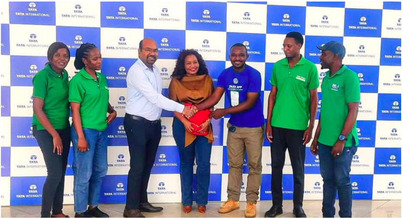
Photo: TakaNiAjira team awarding TATA gifts obtained from the waste collected in the Reward 4 Recycling Program