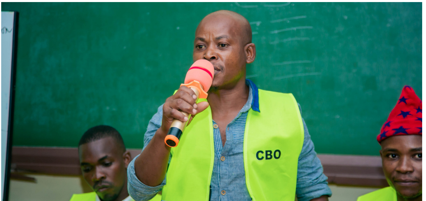
Photo: A Waste Picker sharing insights at the Global Waste Pickers Day Summit

With this theme, our aim was to shed light on the invaluable contribution of waste pickers to the waste management ecosystem. We wanted to highlight their efforts, acknowledge their hard work, and show our appreciation for their contributions. It was an opportunity for us to recognize the important role that they play in our communities.