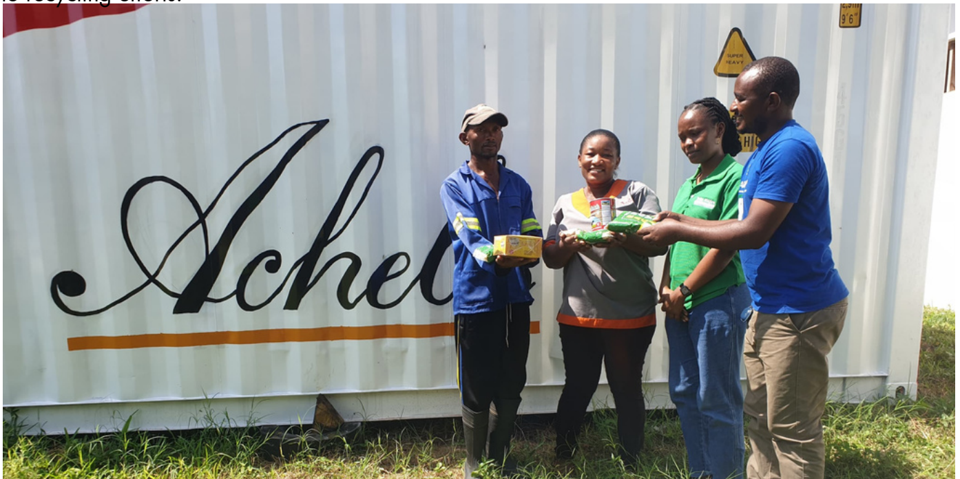
Photo: TakaNiAjira team awarding employees at Achelis gifts obtained from the waste collected in the Reward 4 Recycling Program

During this first quarter of 2024, the motto behind our Reward4Recycling initiative is #LetaTakaUlambeSukari, a Swahili phrase which translates to #BringWasteGetSugar. In line with this mantra, we are working with esteemed companies such as TATA, AGS Movers & Achelis, Jubilee Insurance and ABSA providing rewards to participants in recognition of their contribution to recycling efforts.