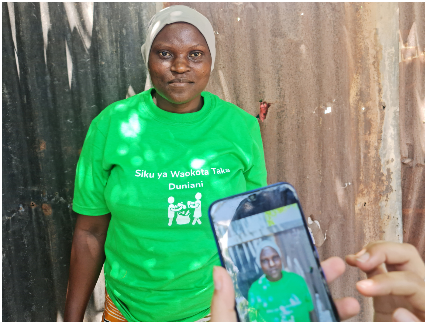
Photo: Ongoing registration of waste pickers.

3. TakaNiAjira Foundation has been successfully registering waste pickers through ZaidiApp. This registration process plays a crucial role in the foundation's commitment to empowering waste pickers and driving substantial transformation in the waste management sector.