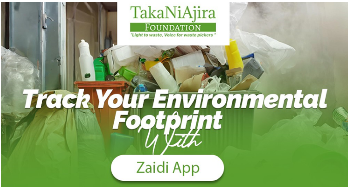
Photo: Track Your Environmental Footprint with ZaidiApp

To streamline our operations and enhance transparency, we utilize the ZaidiApp, a digital platform designed to track the environmental impact achieved by organizations. Through the app, digital reward bins are created to track all waste generated and sorted by participating organizations. This allows us to provide real-time feedback to clients, empowering them to monitor their environmental footprint and track progress