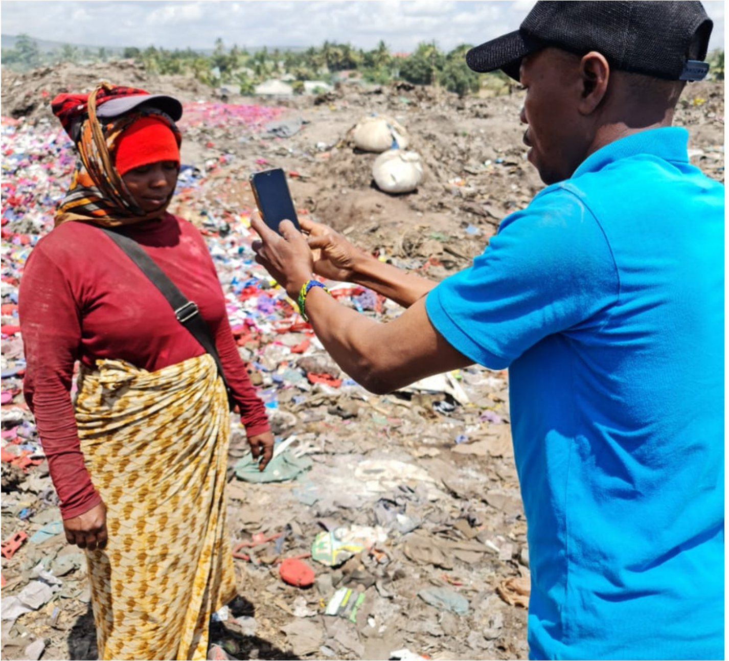
Photo: A waste picker having her picture taken for registration in ZaidiApp.

TakaNiAjira's embrace of technology represents a new era in waste management, one where data-driven insights and empowerment go hand in hand. As we continue to refine and expand our use of ZaidiApp, we are poised to create a lasting impact on the lives of waste pickers and the waste sector as a whole.