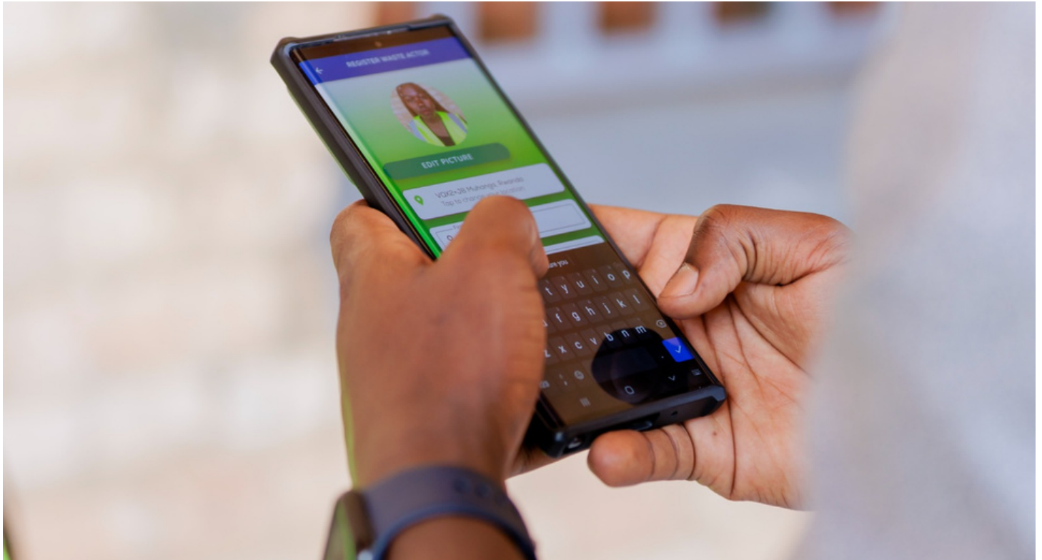
Photo: Ongoing registration of waste pickers using ZaidiApp