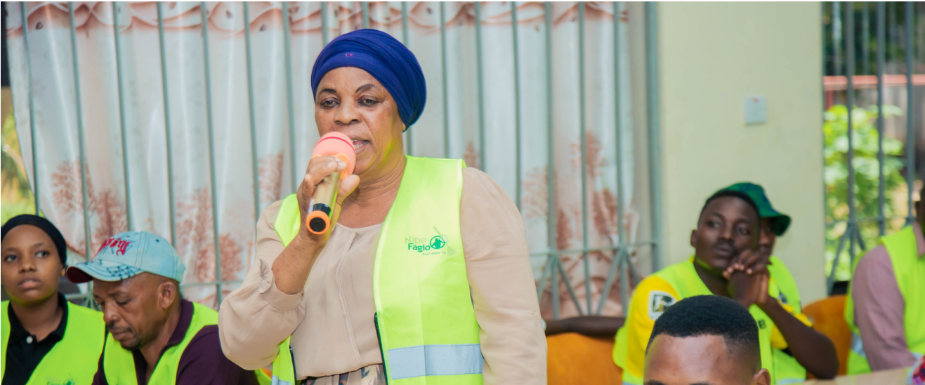
Photo: A Waste Picker sharing insights at the Global Waste Pickers Day Summit

Moreover, we sought to emphasize the importance of building and valuing waste pickers as integral members of our communities. We believe that waste pickers should be appreciated, respected, and valued for the work they do. They are not just waste collectors, but they are also environmentalists who are playing a significant role in protecting our planet.