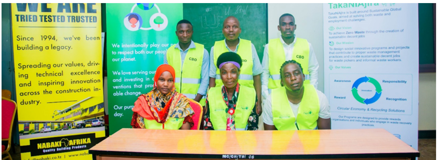
Photo: A group photo of the newly elected TAWAPA leaders

3. Formation of Tanzania Waste Pickers Association (TAWAPA): The summit facilitated the election of leaders for the newly established Tanzania Waste Pickers Association (TAWAPA), which is a significant milestone. TAWAPA serves as a unifying body for waste pickers across the country, enabling them to amplify their voices and advocate for their rights collectively.