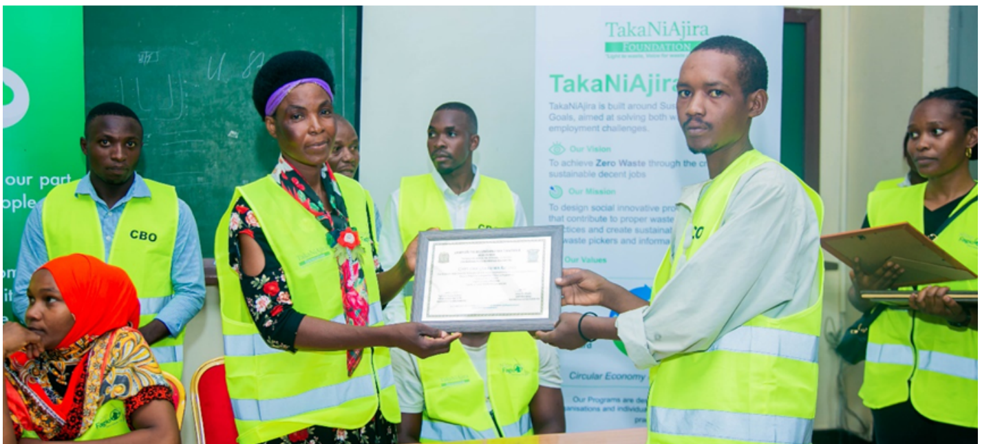
Photo: A member of a registered Community-Based Organization receiving their certificate.

1. Recognition and Certification of Community-Based Organizations (CBOs): We unveiled the CBOs that we helped form and issued official certificates for their registration. These CBOs are a crucial step in formalizing the waste pickers' collective efforts and providing them with a structured platform for advocacy and collaboration