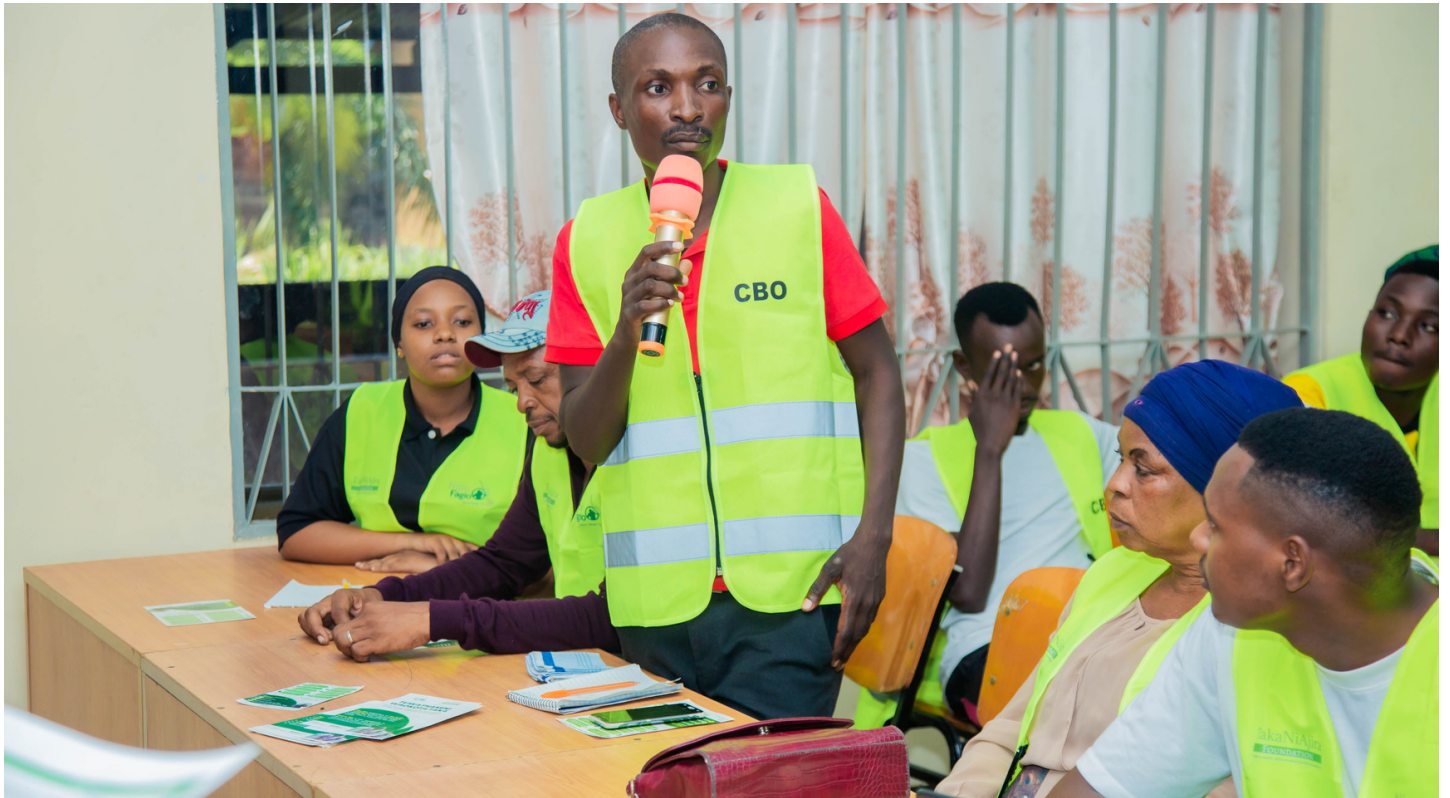
Photo: A Waste Picker sharing insights at the Global Waste Pickers Day Summit

With this theme, our aim was to shed light on the invaluable contribution of waste pickers to the waste management ecosystem. We wanted to highlight their efforts, acknowledge their hard work, and show our appreciation for their contributions. It was an opportunity for us to recognize the important role that they play in our communities.