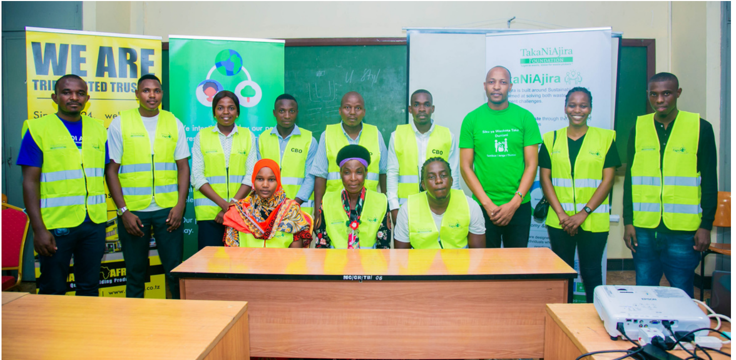
Photo: Waste pickers group representatives pictured with summit organizing committee.

The Global Waste Pickers Day Summit is a remarkable display of our dedication to empowering waste pickers and promoting their status within society. This summit is a platform that recognizes the invaluable contribution of waste pickers in environmental conservation and community development. It is a celebration of their hard work, while also serving as a reminder that their work is essential for a sustainable future.