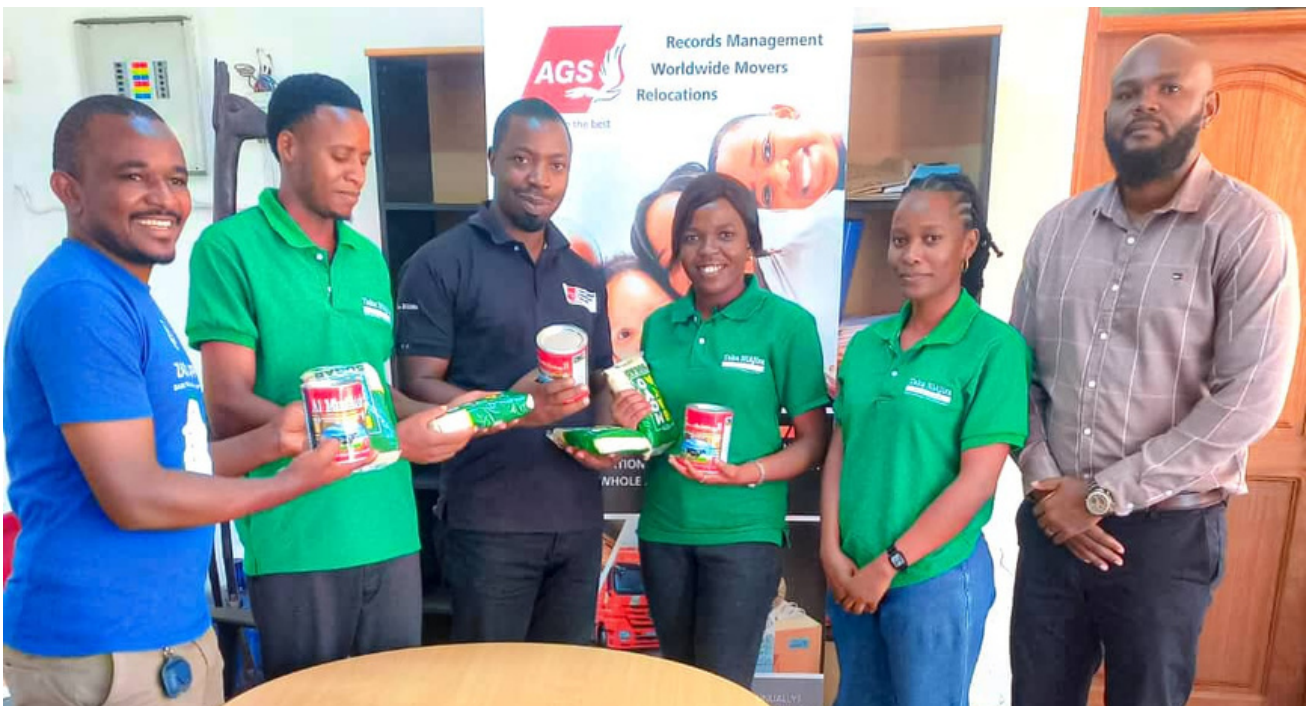
Photo: TakaNiAjira team awarding AGS Movers gifts obtained from the waste collected in the Reward 4 Recycling Program